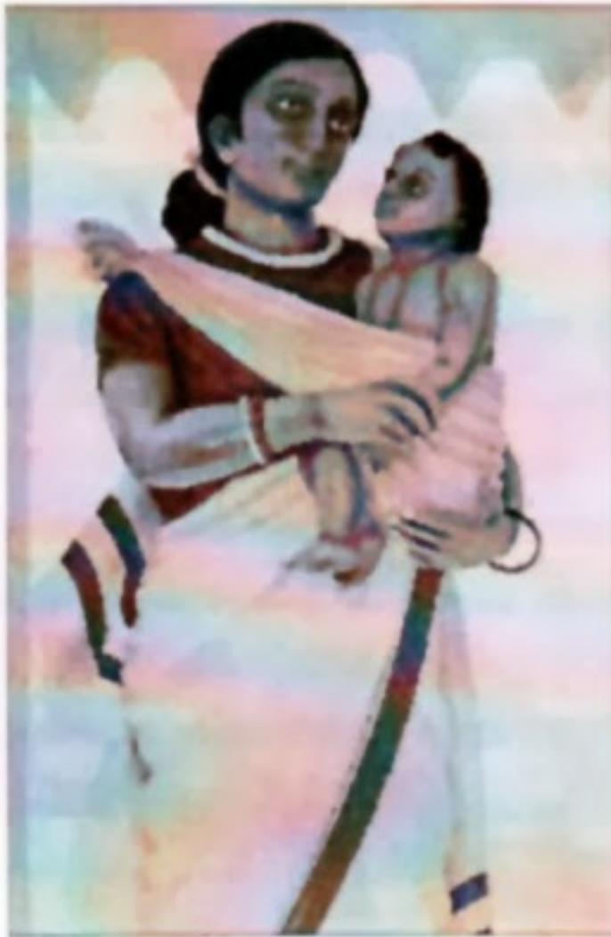
Statue of Our Lady (Singpur, Jharkhand)