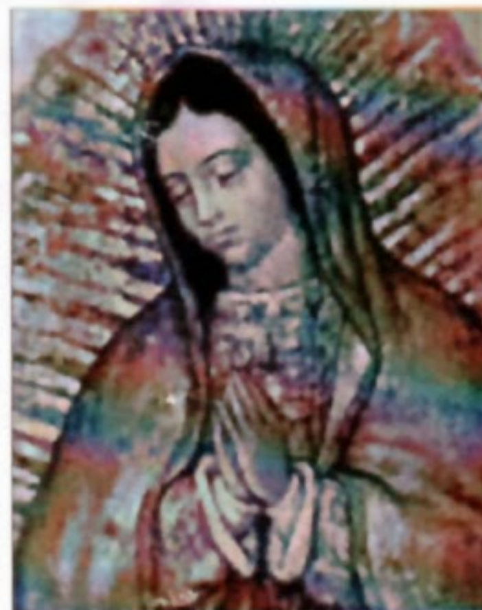
Miraculous Picture of Our Lady of Guadalupe